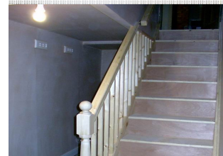
Constructing the staircase