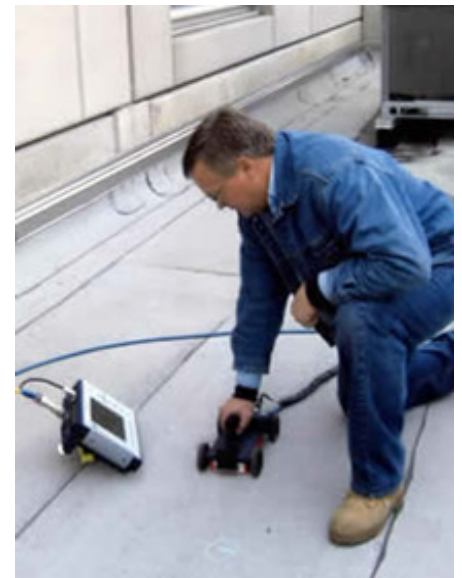
Taking an X-ray of concrete

4. Reinforcing steel corrosion is both a chemical and an electrical process. Corrosion can produce low-level voltage similar to a battery. Half-cell testing involves setting up an electrical circuit that can be connected to reinforcing steel at regular intervals, usually on a grid. The electrical potential (voltage) is then measured at the grid points. A high potential correlates to a high risk of corrosion. Half-cell testing is an effective means of identifying parts of a structure most vulnerable to steel corrosion.