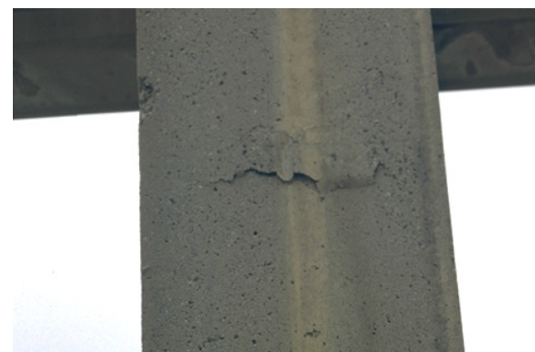
Reinforcement corrosion due to loss of pH-value of the concrete

It has only been in recent years that the addition of chloride has been discouraged in reinforced concrete. Calcium chloride was first used as a set accelerator in the late 1980s usually during the winter months but now it has been discouraged due to its accelerating effect on the corrosion of the reinforcing steel.