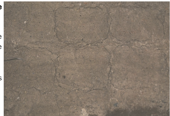
Cracking caused by sulphate attack

Due to the steel being an excellent conductor, the voltage tends to transmit through the reinforcing cage, but will arc through concrete at discontinuities. Consequently, an electrically continuous reinforcing cage minimizes damage. At discontinuities, explosive spalls are likely to occur. Also, if reinforcing steel is heated sufficiently, it will expand and may crack the surrounding concrete.