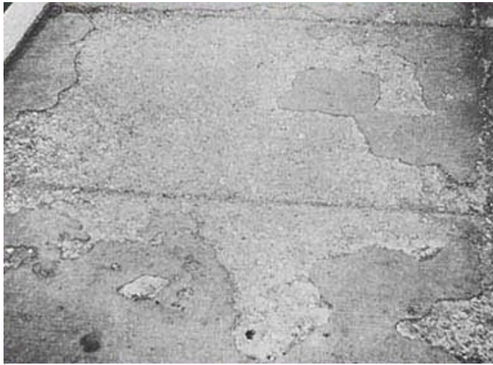
Damage caused by Freeze & Thaw