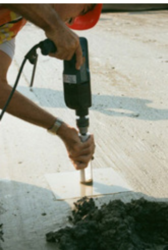
Taking a concrete sample

Once the inspection and any tests have been carried out and the information has been collated, only then can an effective repair or maintenance plan be specified.