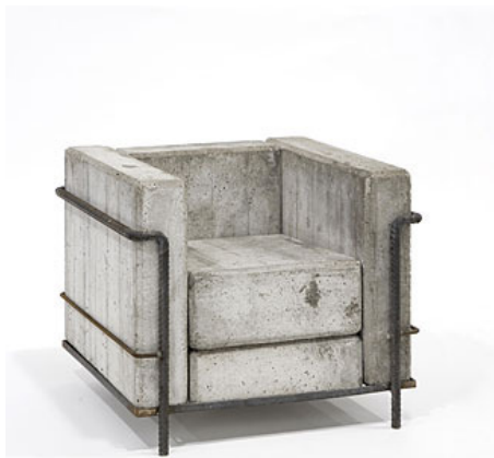
Concrete - a versatile construction material