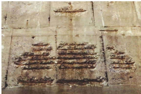
Corrosion through insufficient concrete cover

There are many things that can influence and cause concrete to deteriorate, however it typically occurs when the material is exposed to the weather, water or other chemicals over an extended period of time. If correctly constructed and protected from these elements the structure will last for decades with very few maintenance issues. However in the real world some sections of a concrete structure are exposed to many of these environments regularly, these include industrial structures, multi-storey car parks and balconies etc. once deterioration has begun it can occur in the embedded steel as well as the surface of the concrete.