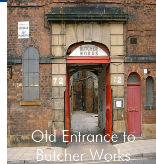
Old Entrance to Butcher Works

To learn more about the damp proofing and timber treatment methods that Timberwise employ please visit www.timberwise.co.uk