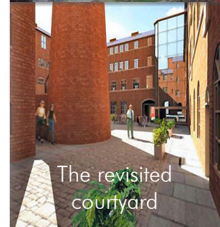
The revisited courtyard