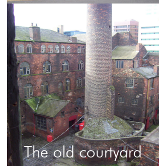
The old courtyard