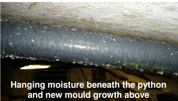
Hanging moisture beneath the python and new mould growth above

Envirowise determined that the problems were associated with the excessive moisture present in the air within the cellar. As a result this moisture, was causing a condensation problem and in turn a mould problem. The solution was simple – the installation of an Envirowise Cellar Positive Pressure System .