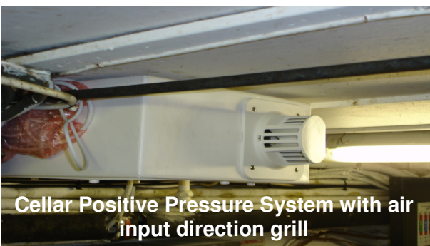
Cellar Positive Pressure System with air input direction grill

The system benefits from our energy saving technology and operates within set temperature perimeters hence the annual running costs are only around £10.00 per year.