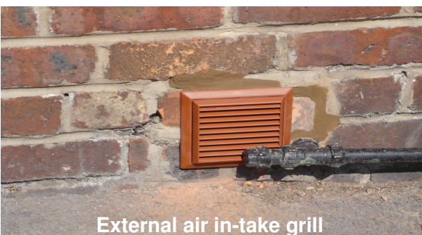
External air in-take grill

For more information about the Envirowise Cellar Positive Pressure System call 0800 288 8661